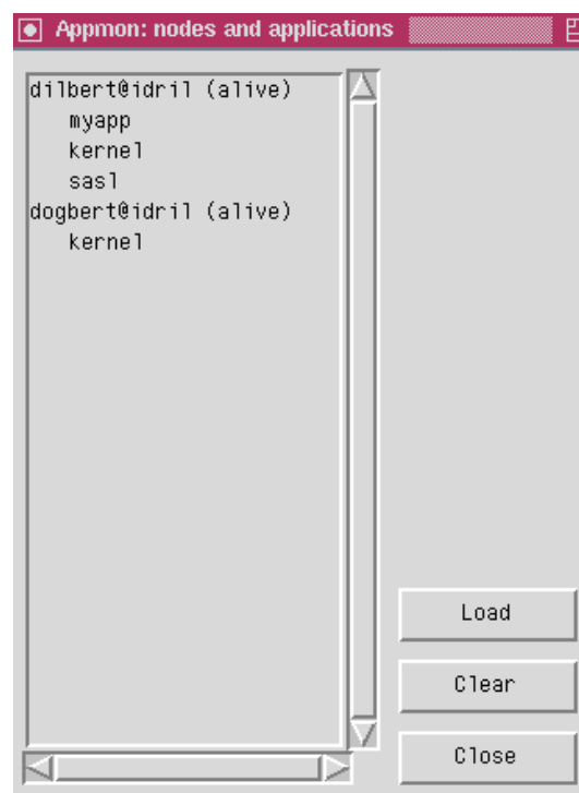
Figure 1.3: The Listbox Window.

The listbox window lists all nodes and applications. This window can be more easy to use than the normal, graphical user interface when the system consists of a large number of nodes and/or applications.